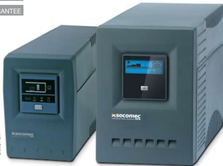
NETYS PE 1000/1400/2000 VA