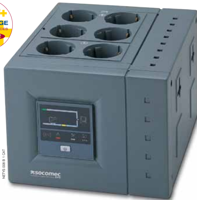
NETYS 008 B 1 CAT